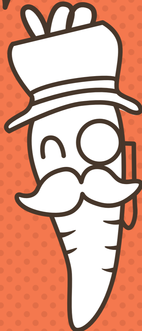
CARLOS THE CARROT (HE'S POSH)

C A M S A T B U E V B X O O F R U I T Y C K D L P N O E A G F J T B G M T H R U T R E E C I Q A H B K J A I K G Z V L C I M V U P N P E O E P E L U D A C R I S Q G V Y L W R V X C Z Y A E F Z K N I F E A Z B M T C S H W N P D P A S T A E A F B K D G C H D Y B R I X L E A V E S J P L A K L G M N B L U E Q E N Z