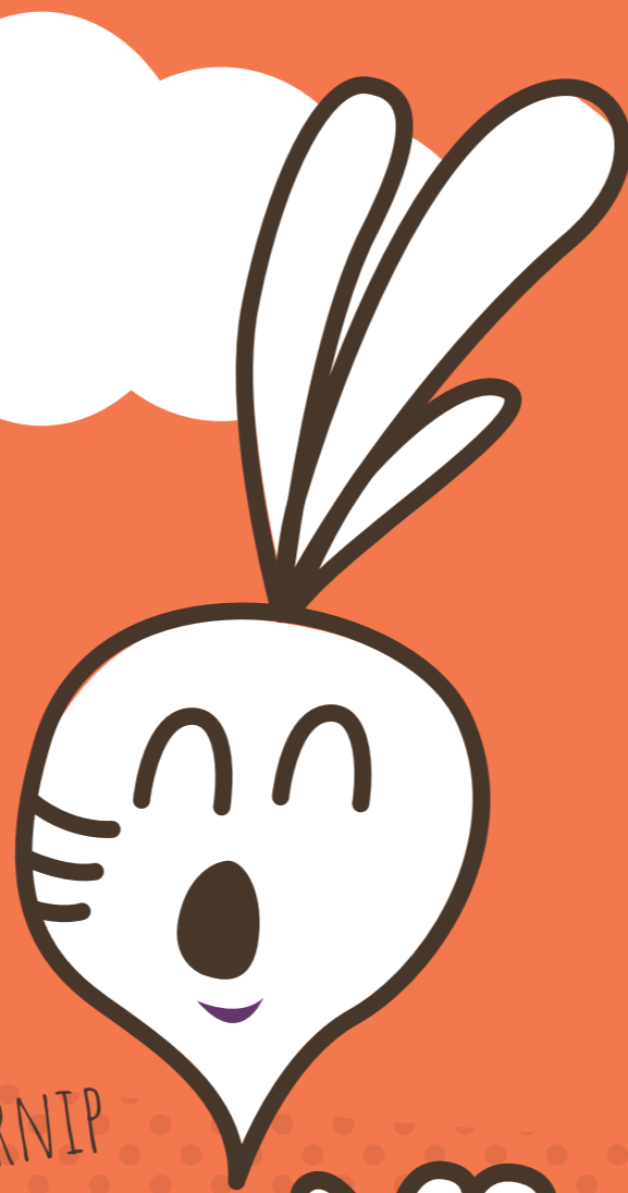
TINA THE TURNIP